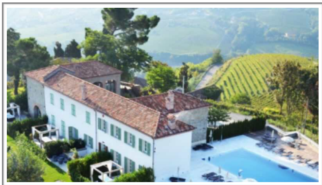
Relais San Maurizio ***** (2 Nights)