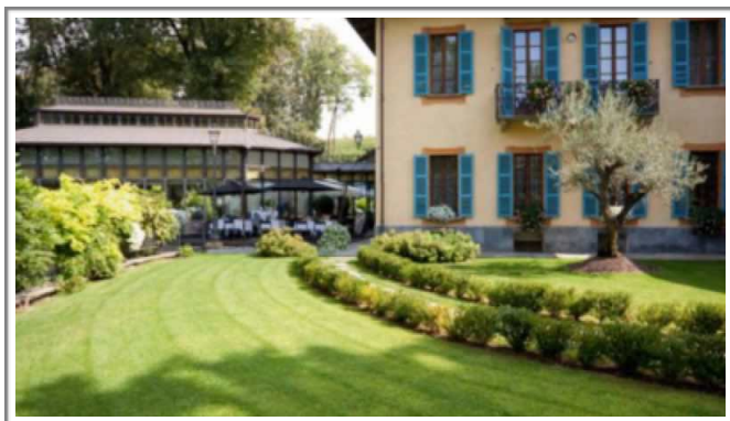
Villa Beccaris **** (2 Nights)