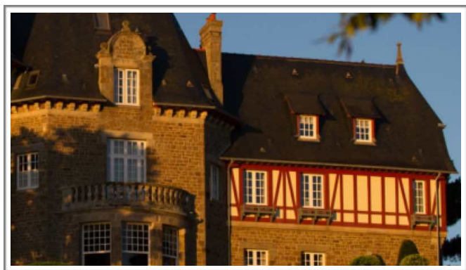
Chateau Richeux **** (1 Night)