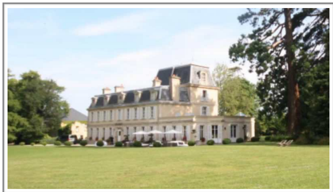
Chateau la Cheneviere **** (3 Nights)