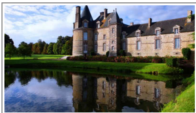
Chateau de Canisy **** (1 Night)